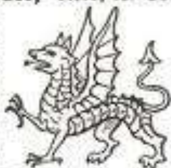
Dragon, as represented in Heraldry.

drag'on (drăg'ŭn), n. [OF., fr. L. draco , -onis, fr. Gr. drakōn .] 1. Now Rare. A huge serpent. 2. A fabulous animal, generally a monstrous winged scaly serpent, lizard, or saurian. 3. A fierce or very strict person, esp. a woman; a duenna. 4. Any of several plants of the arum family popularly associated with dragons. 5. A word used in the Authorized Version to translate several Hebrew forms, some of which are translated by jackal or serpent in the Revised Version. 6. Formerly, a short musket carried hooked to a soldier's belt; also, a soldier carrying such a musket. 7. An armored tractor. 8. Any of a genus ( Draco ) of small arboreal lizards of the East Indies and southern Asia. Some of the hind ribs, on each side, are prolonged and covered with weblike skin, aiding them in leaping from tree to tree; — called also flying dragon . 9. [cāp.] Astron. The constellation Draco.